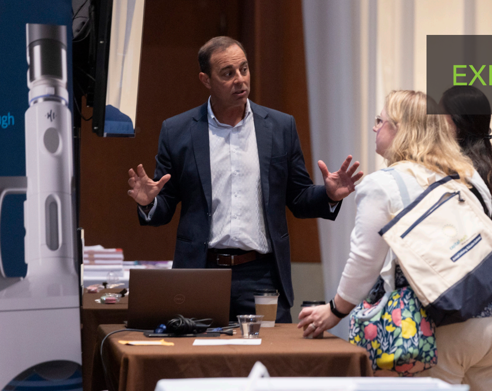
EXHIBIT SPACE INCLUDES: