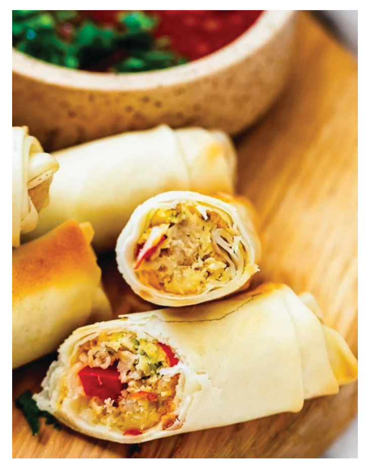
Recipe and image adapted from skinnytaste.com