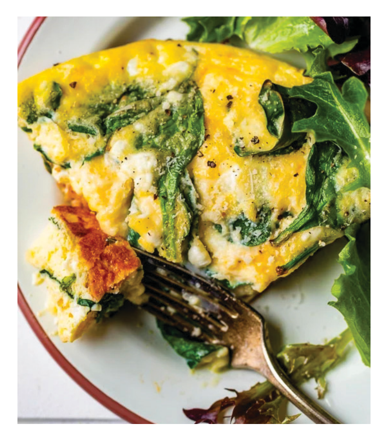
Recipe and image adapted from skinnytaste.com