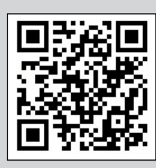
Scan this QR Code™ to learn more about the Diabetes Education Program and other Capital Health events.