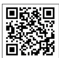
Scan this QR Code™ to learn more about Capital Health Orthopedics.

Is it time to consider a knee replacement? At Capital Health Hopewell, the region's progressive new hospital, we have 50 highly experienced orthopedic surgeons ready when you are. With a dedicated orthopedics unit, specialized nursing care, on-floor rehab, and an capitalhealth.org/ortho