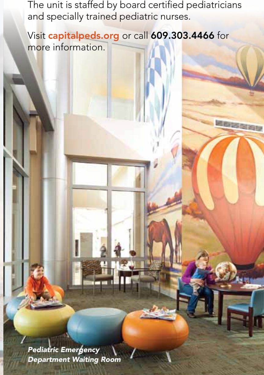
Pediatric Emergency Department Waiting Room

Visit capitalpeds.org or call 609.303.4466 for more information.